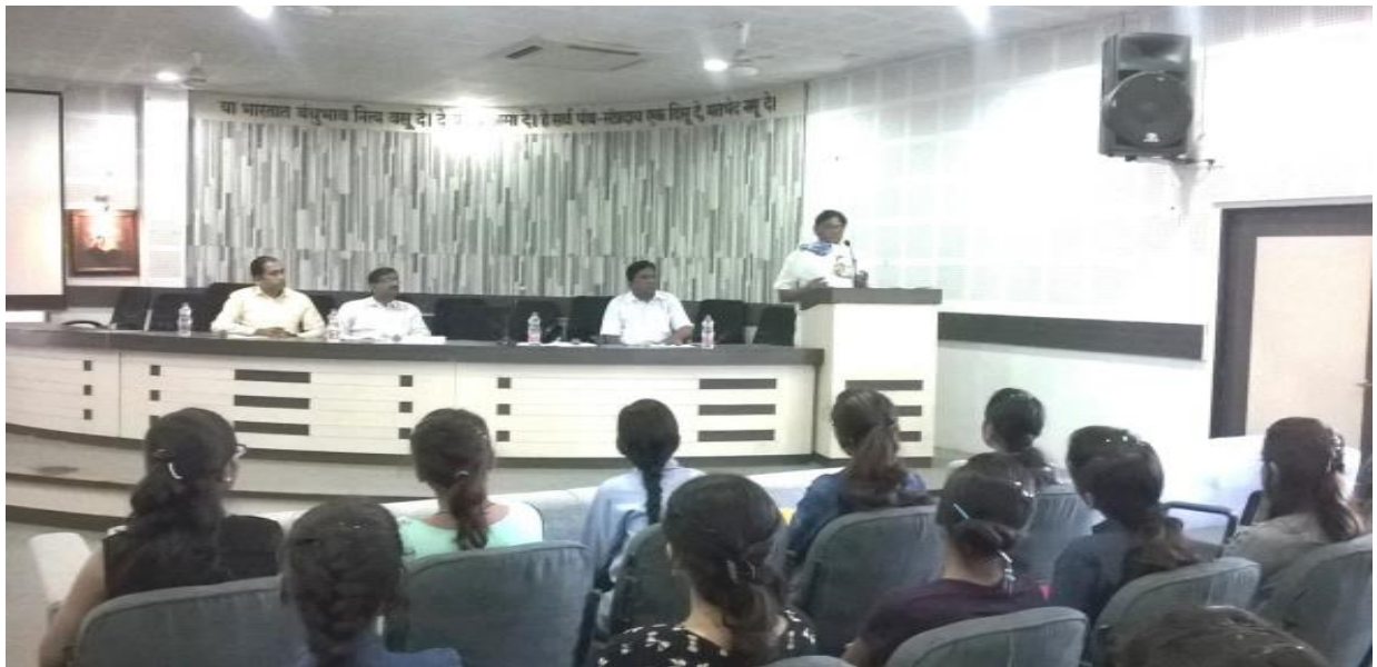
Glimpse of Meeting with Honorable principal addressed the newly admitted BCA students