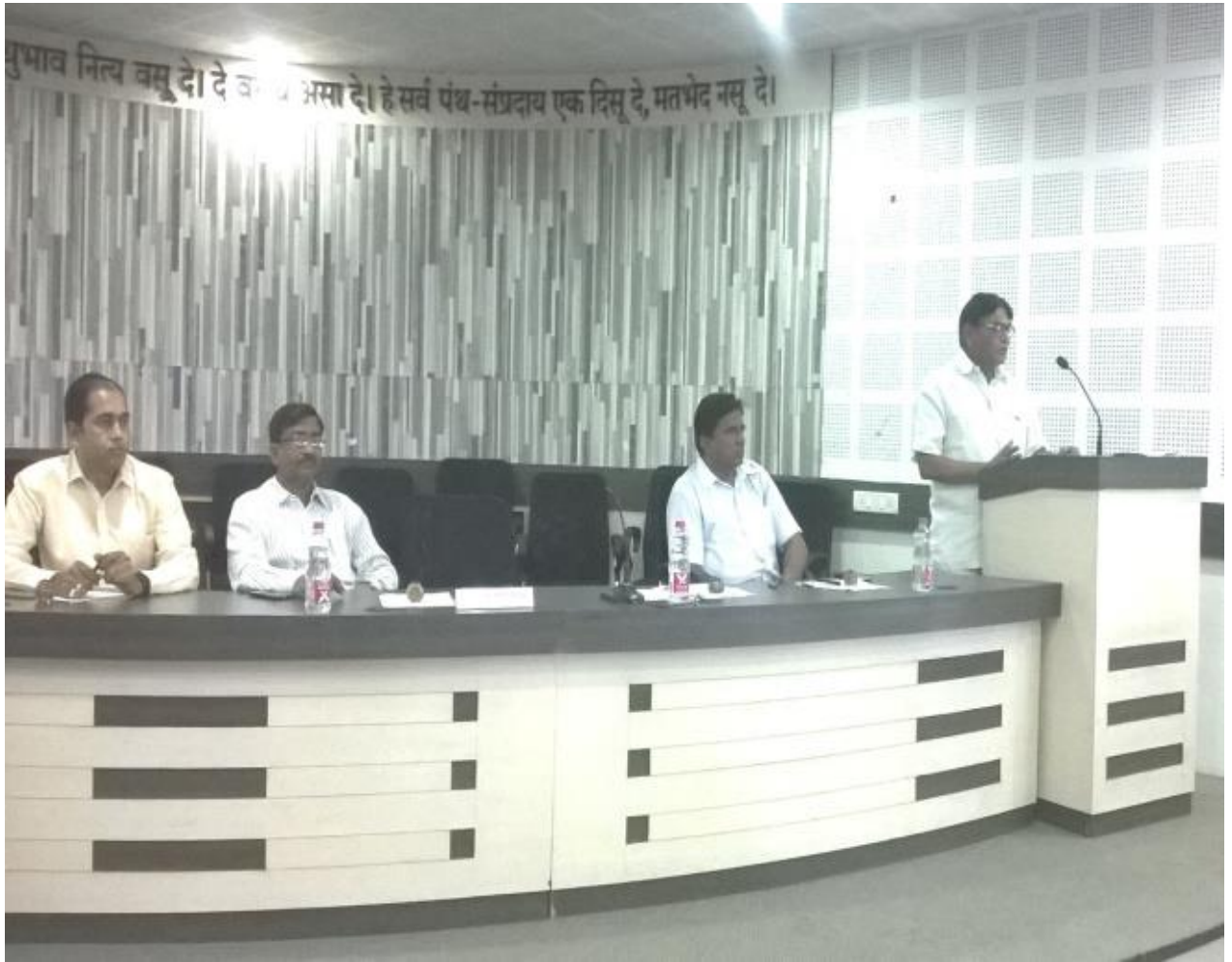
Honorable principal addressed the newly admitted BCA students